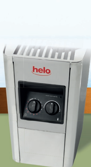
Handy manual controls