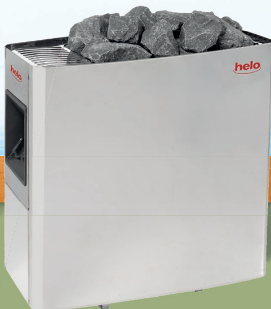
Chrome steel cover